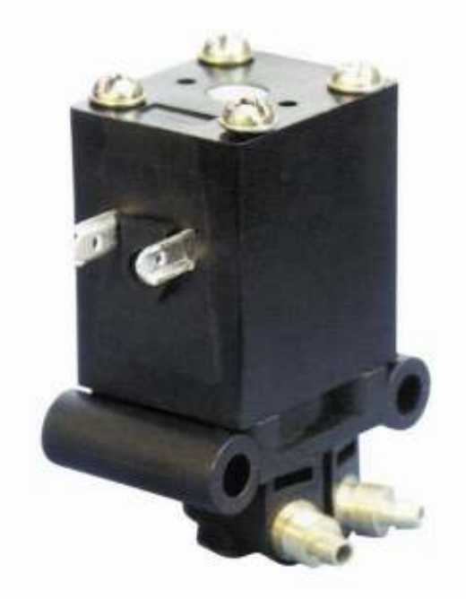
Picanol OMNIPLUS-III relay solenoid valves