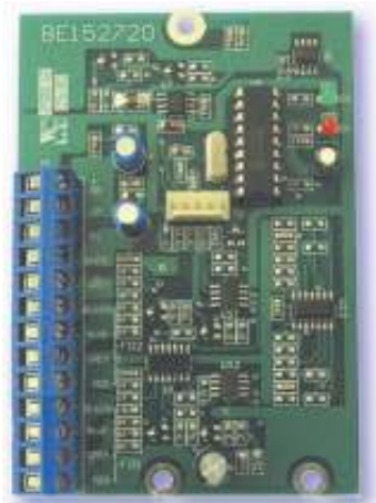
Picanol OMNIPLUS-A main solenoid valves